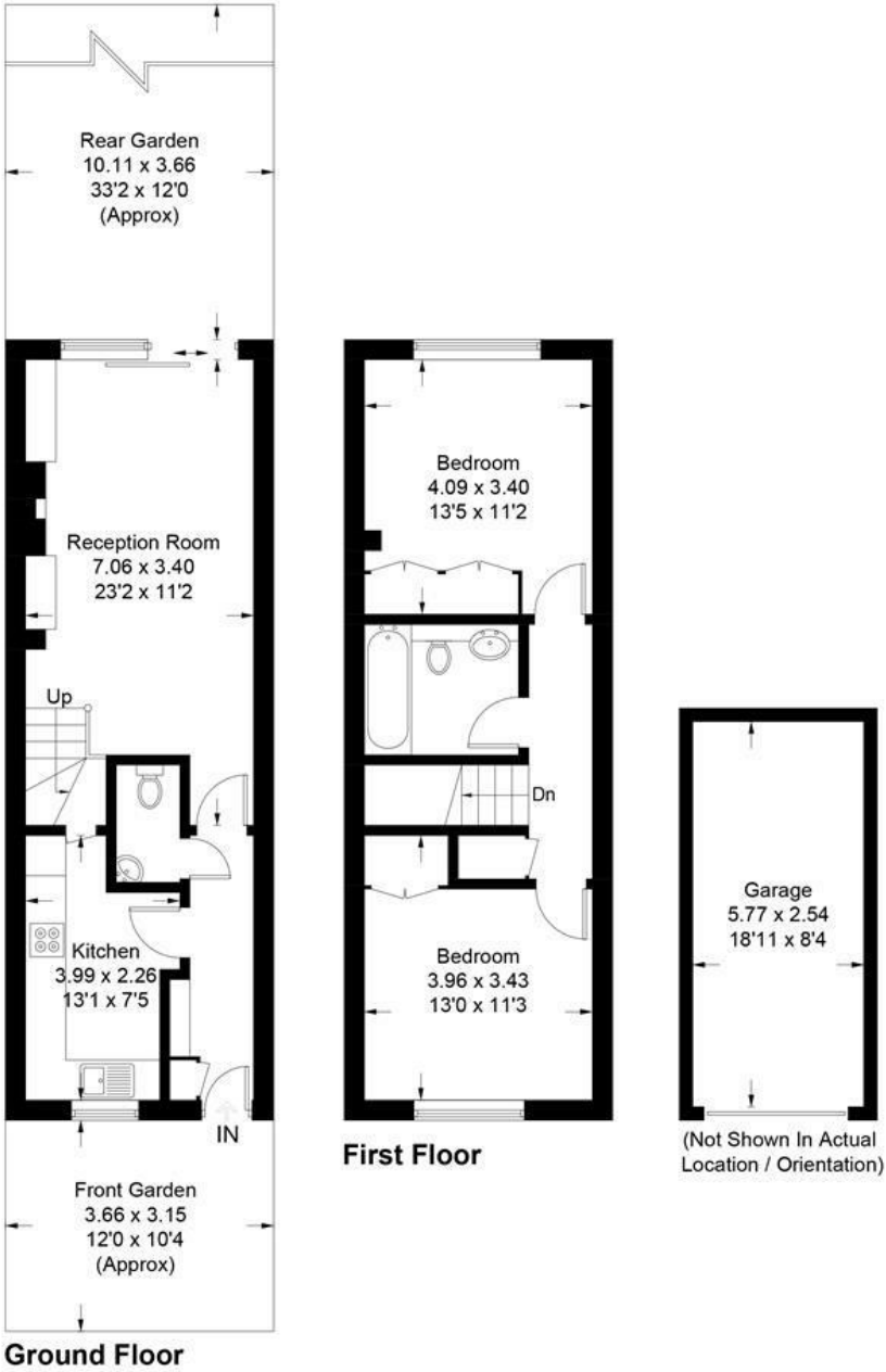
Illustration for identification purposes only, measurements are approximate, not to scale. (ID1209198)