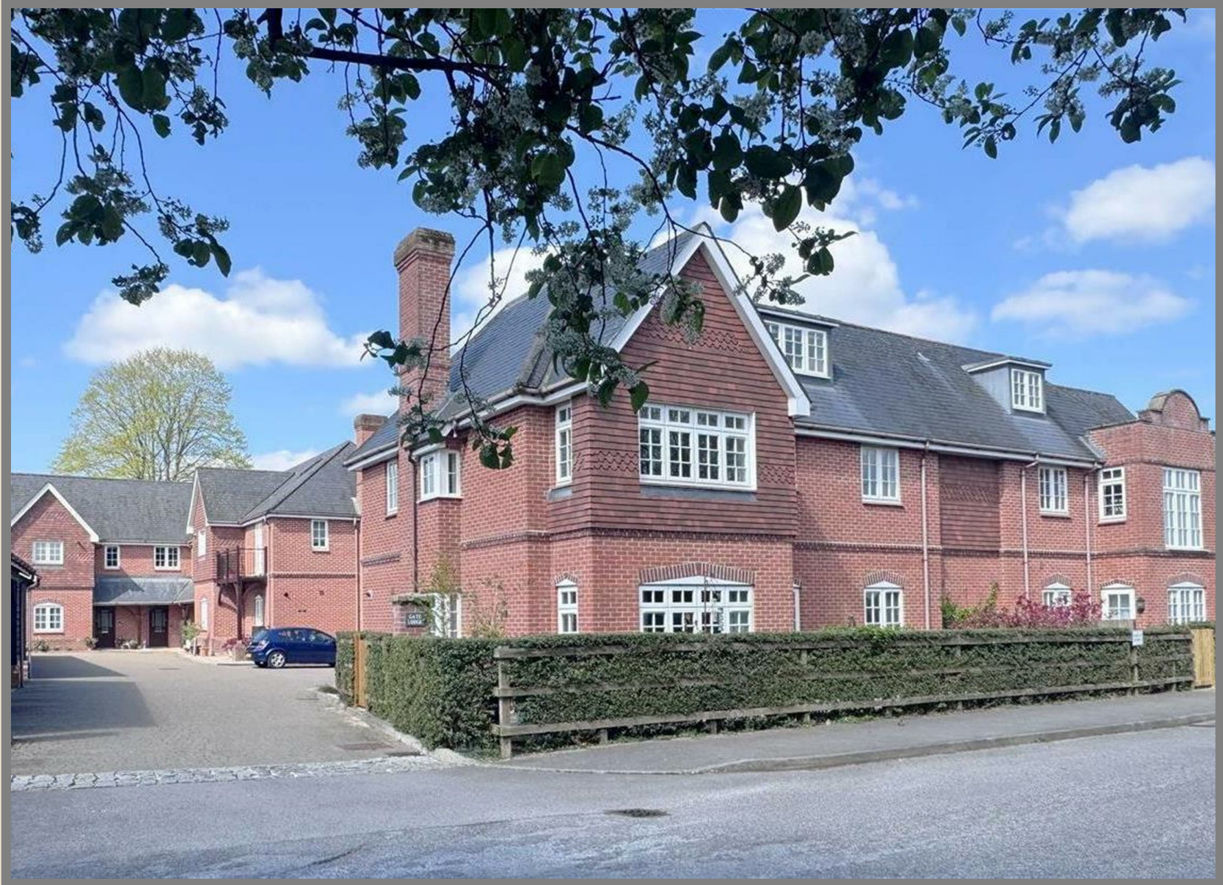
Gate Lodge, Enborne Gate, Newbury, RG14 6GL