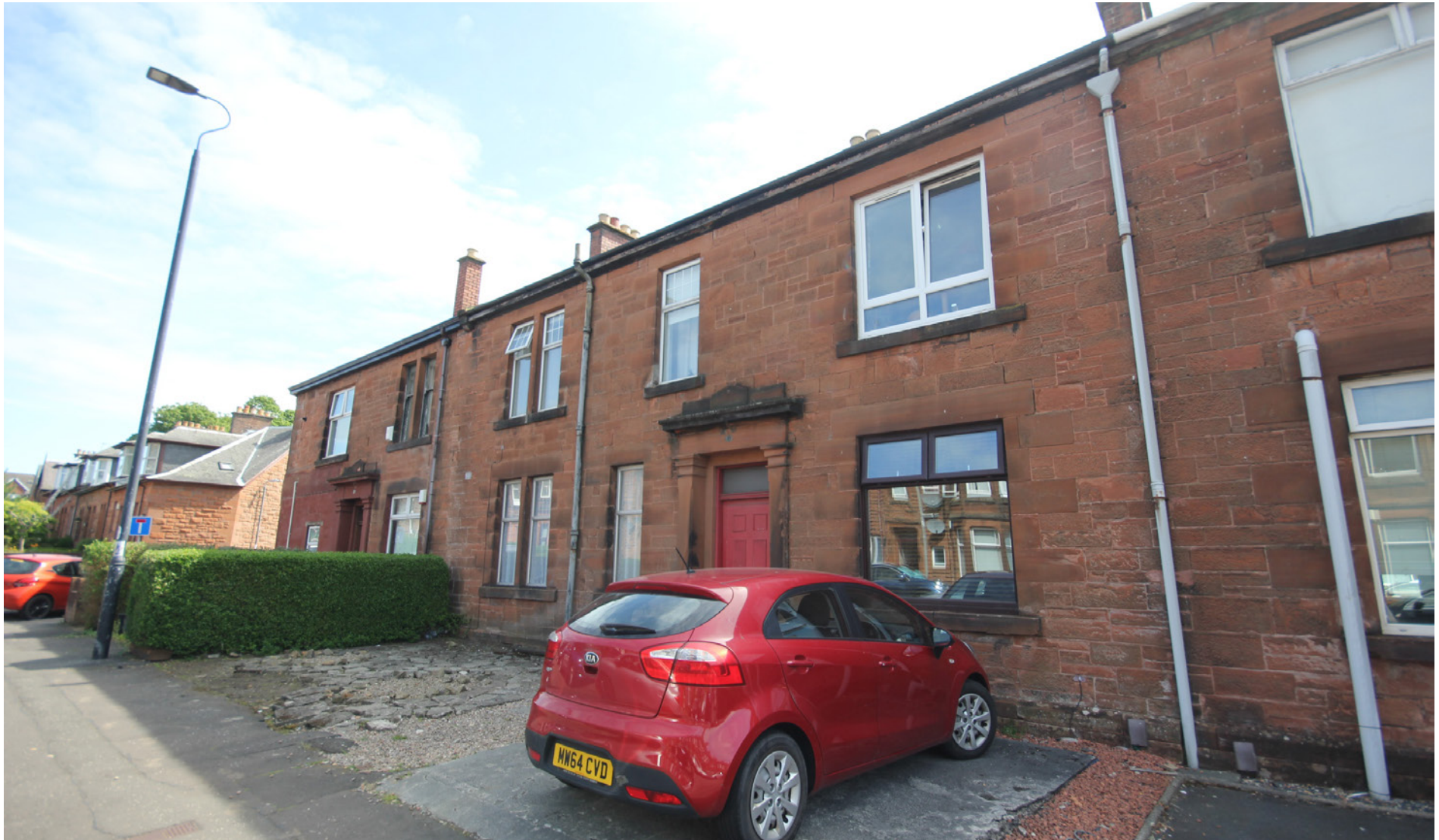
D/L 40 Glebe Road, Kilmarnock KA1 3DL Offers Over £40,000