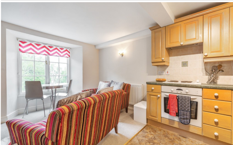
Open Plan Living Room and Kitchen