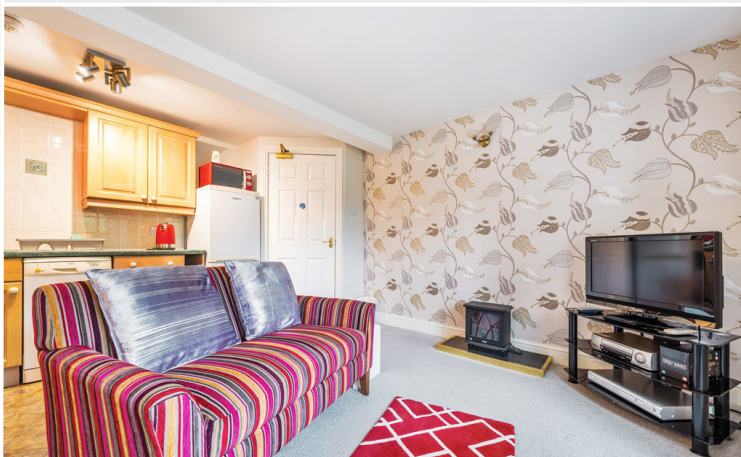
Open Plan Living Room and Kitchen