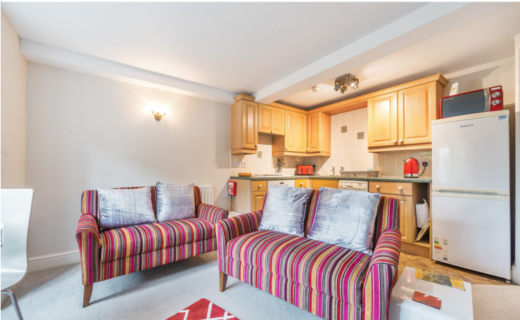
Open Plan Living Room and Kitchen