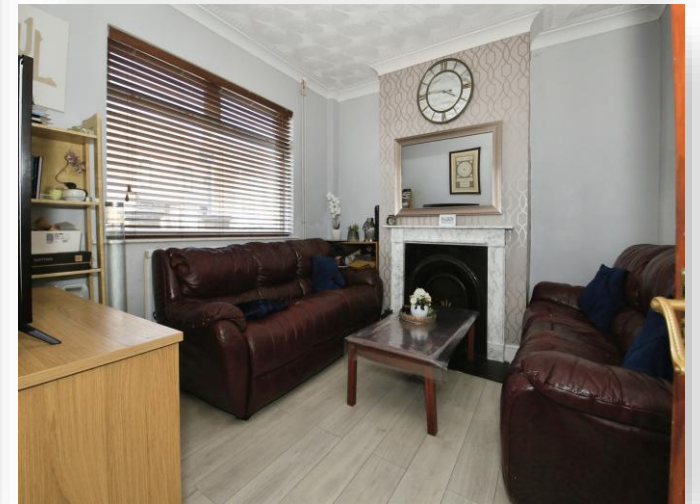
Mayors Walk, Peterborough PE3 6EU