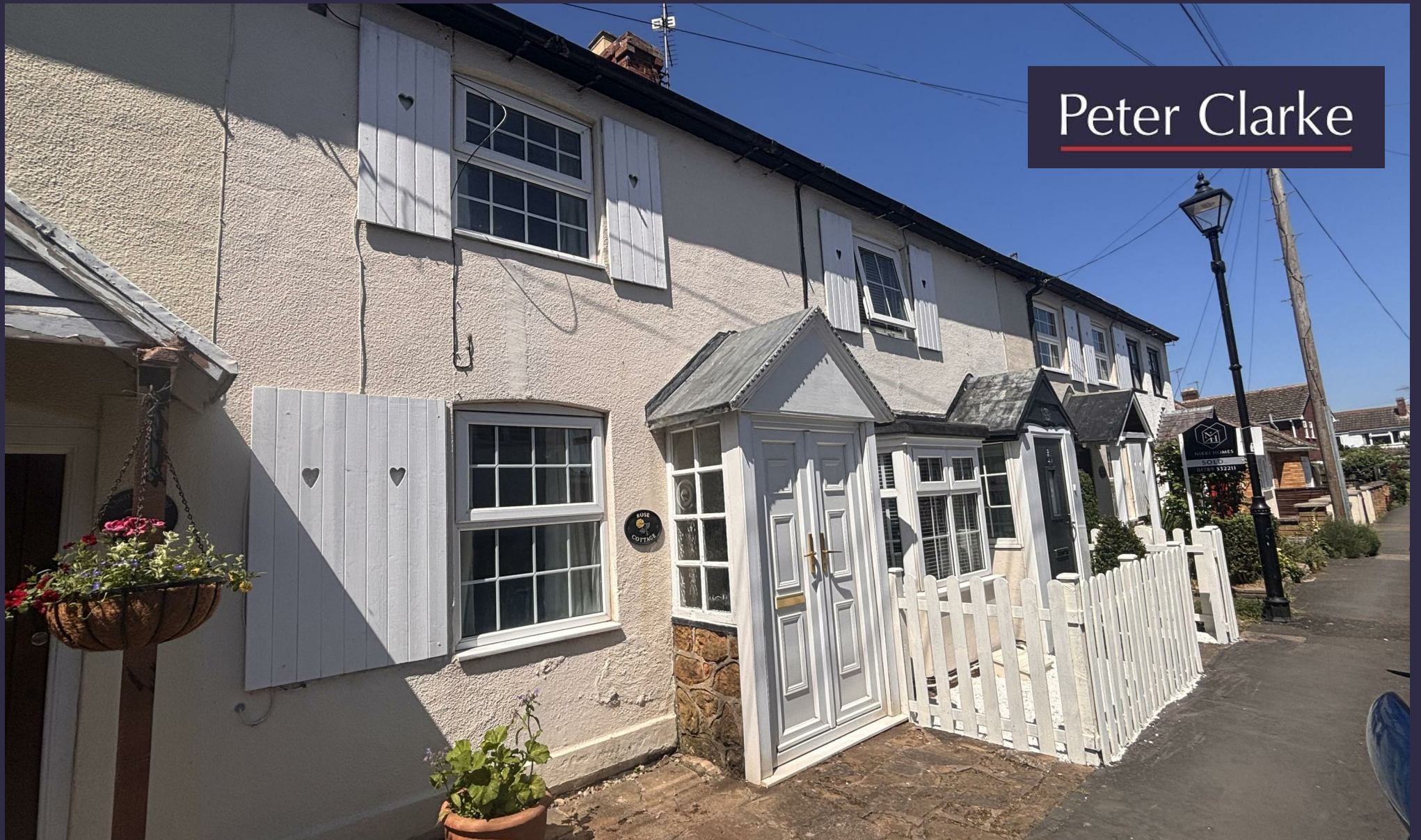
Rose Cottage 23 Cherry Orchard, Wellesbourne, Warwick, CV35 9NB