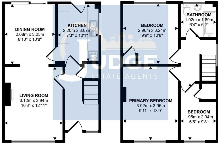
Ground Floor Approx 36 sq m / 387 sq ft

Approx Gross Internal Area 73 sq m / 789 sq ft