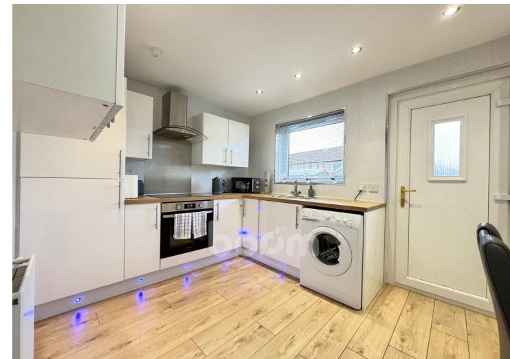
Rowan Place, Beith