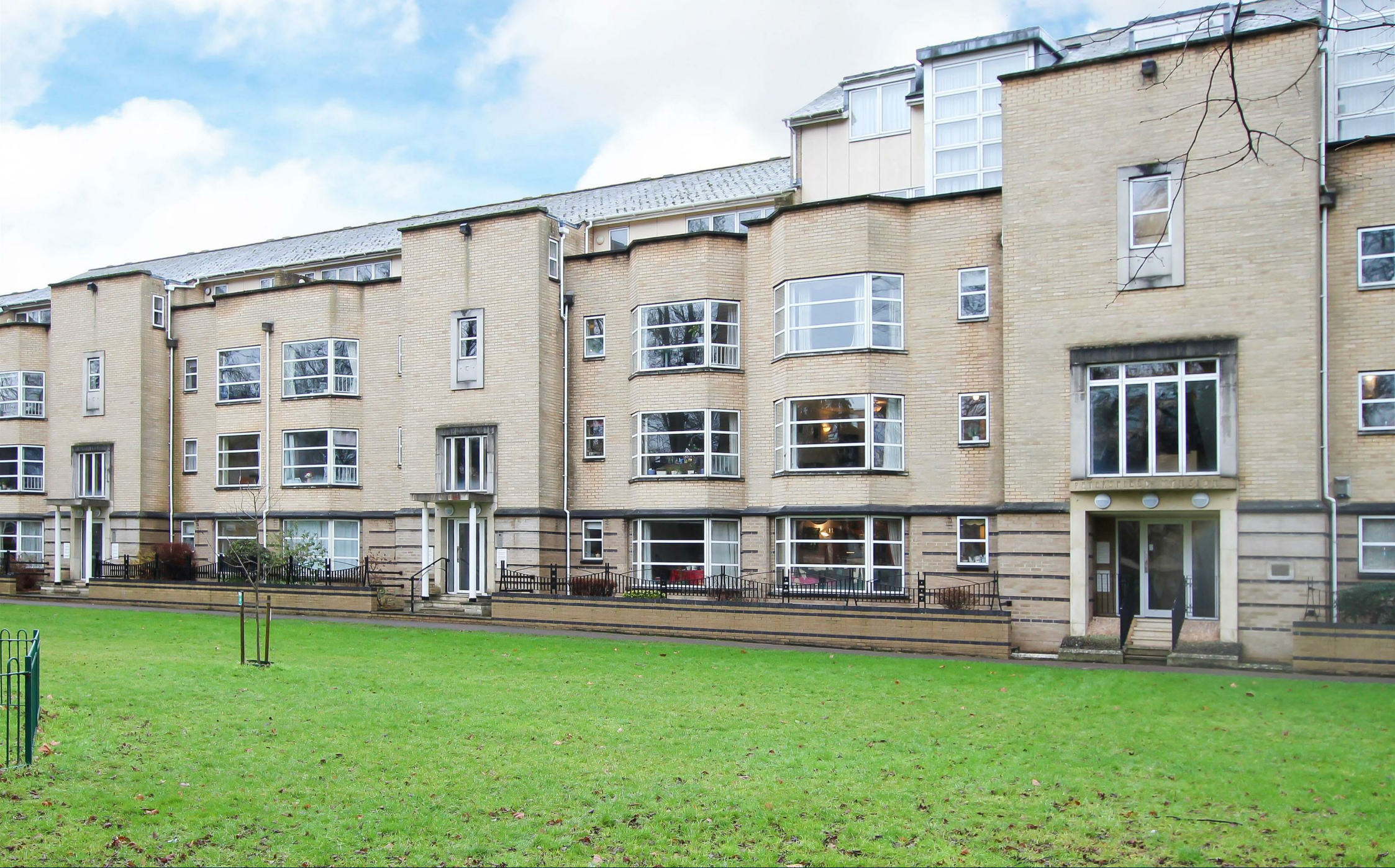
Petersfield Mansions, Petersfield, Cambridge, CB1 1BB