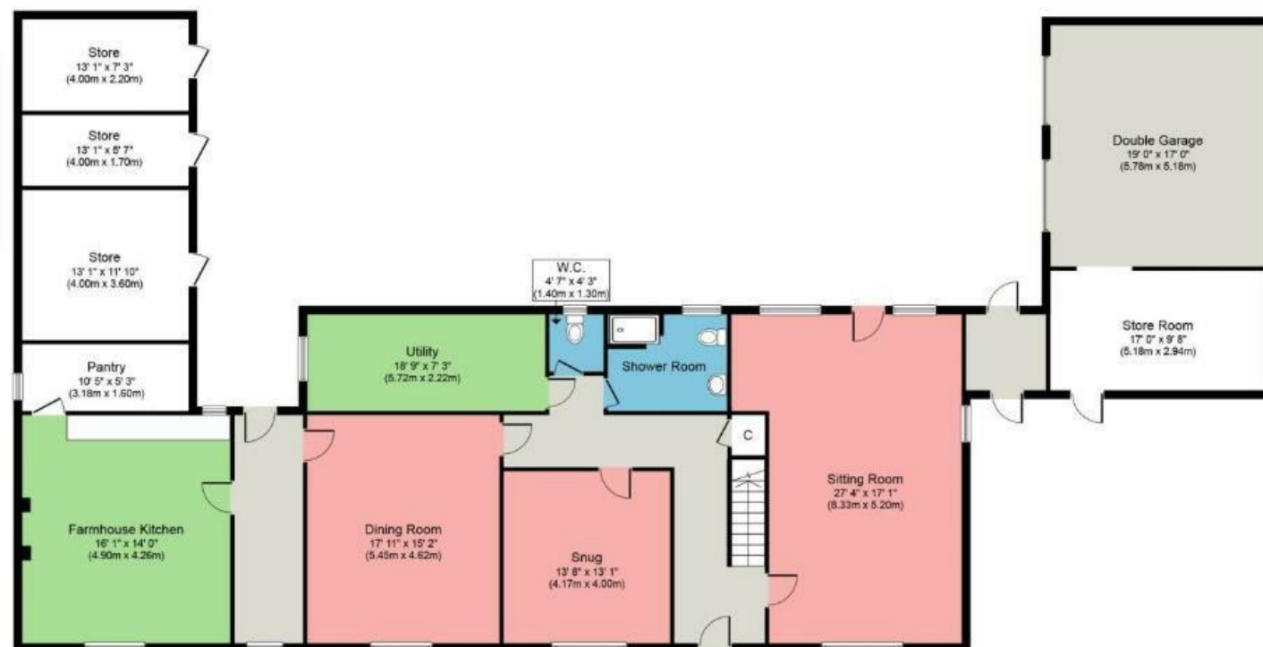
Ground Floor Approximate Floor Area 2,681 sq. ft. (249.1 sq. m.)