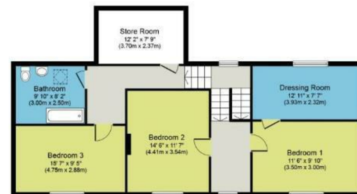
First Floor Approximate Floor Area 978 sq. ft. (90.8 sq. m.)