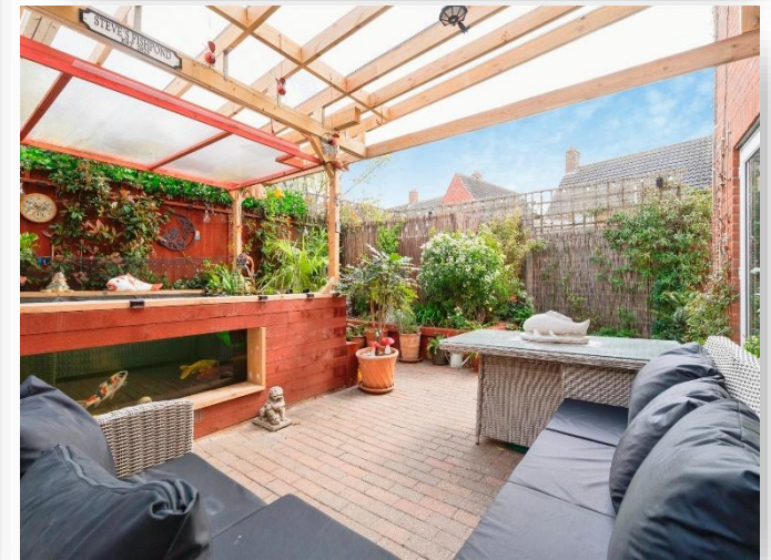
Brickweave House, Lancaster Avenue, Fakenham NR21 8DJ