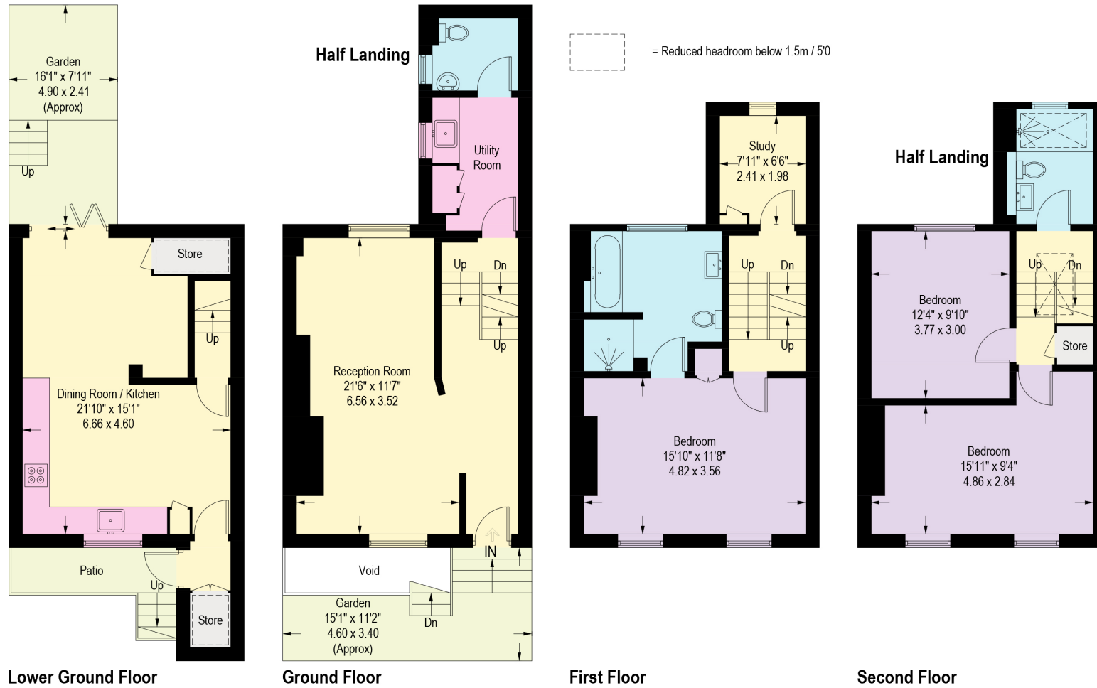
Illustration for identification purposes only, measurements are approximate, not to scale. (ID1285987)

Approximate Gross Internal Area = 147.4 sq m / 1587 sq ft