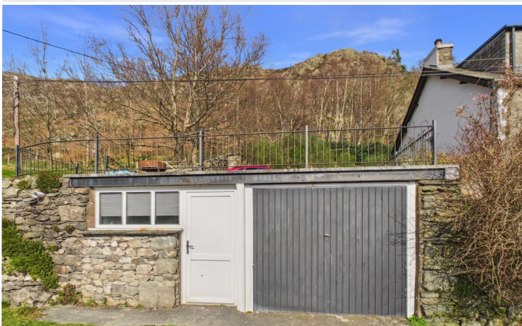
Workshop and Garage