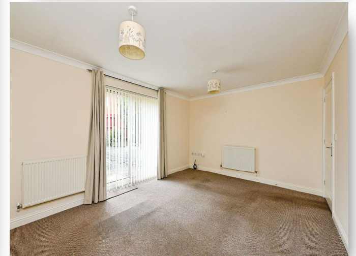
Mallard End, Downham Market, PE38 9HN