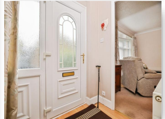
Welbury Close, Stockton-On-Tees TS18 5LJ