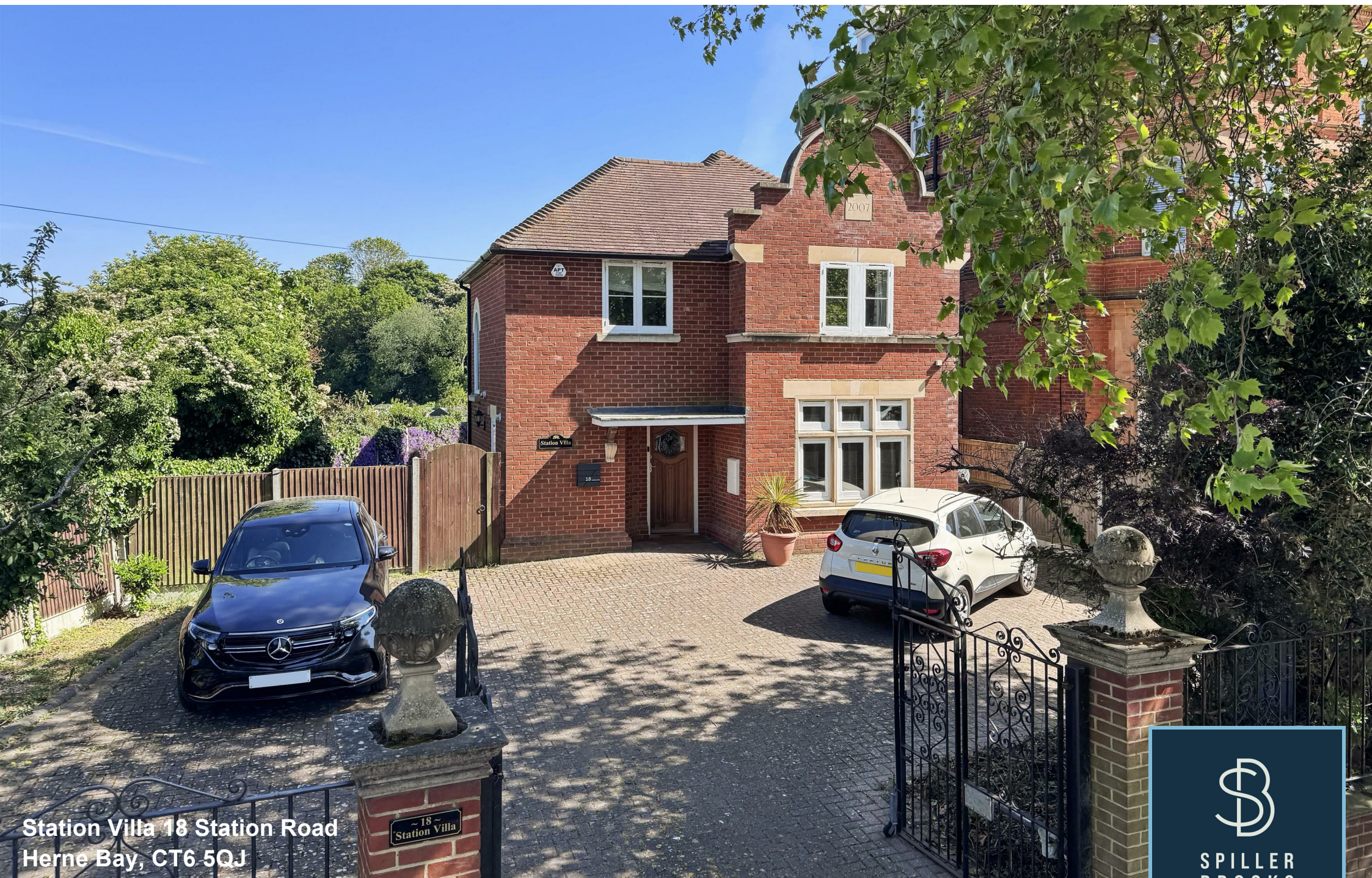
Station Villa 18 Station Road Herne Bay, CT6 5QJ