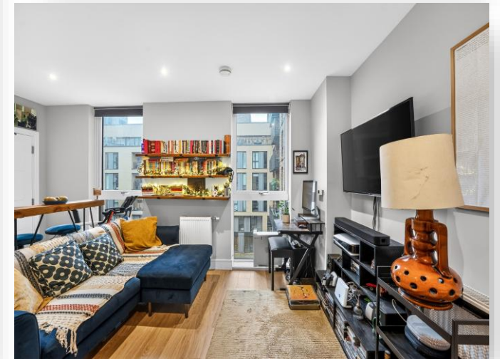
Mauger Heights, Summerstown, London SW17 0GZ