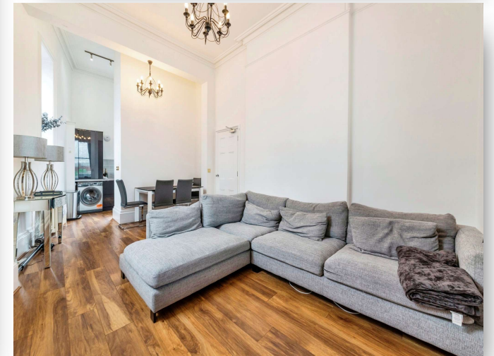
The Offices Castle Brewery, Newark NG24 4AF