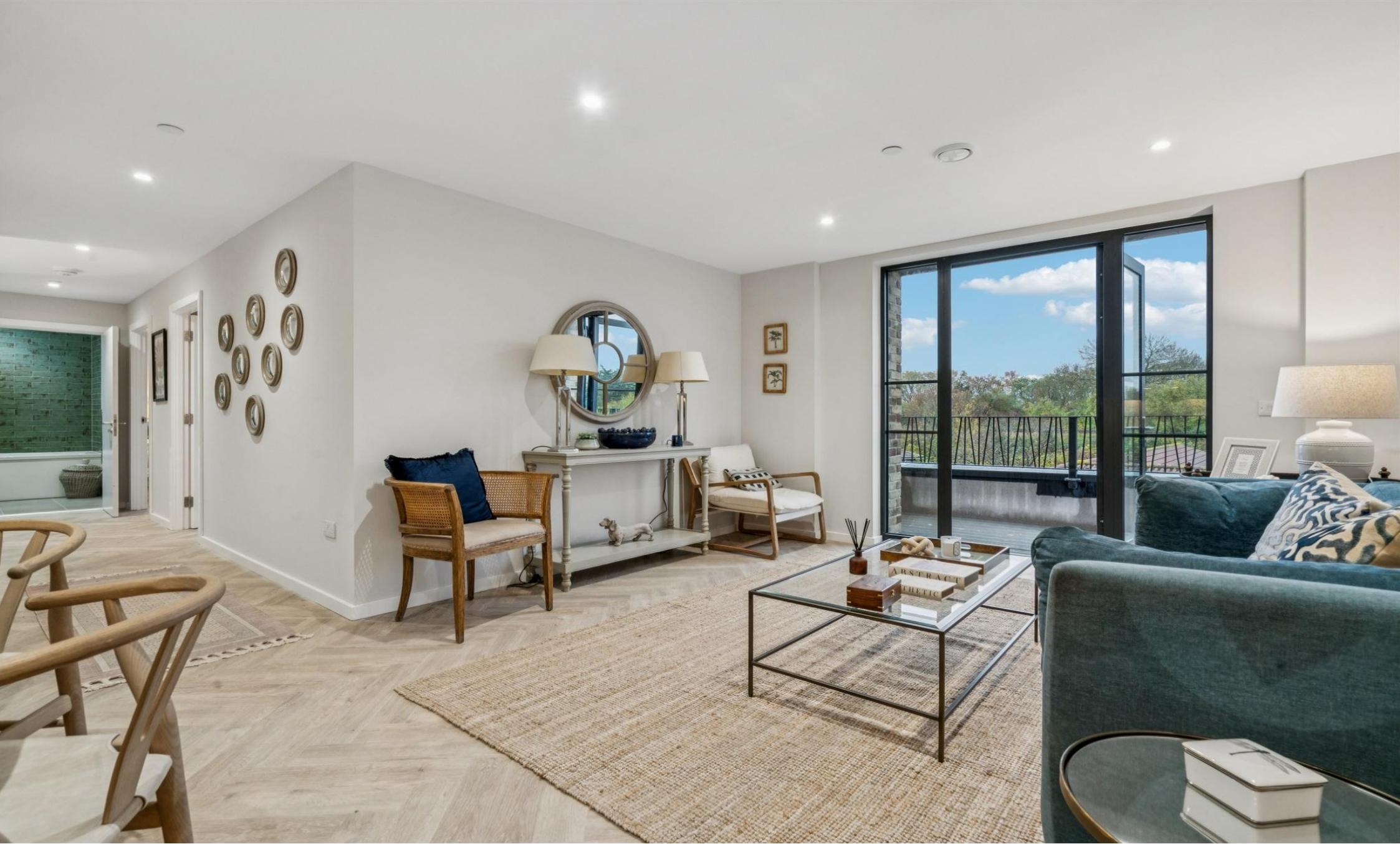
Meadow House Fallsbrook Road, London SW16 6DY