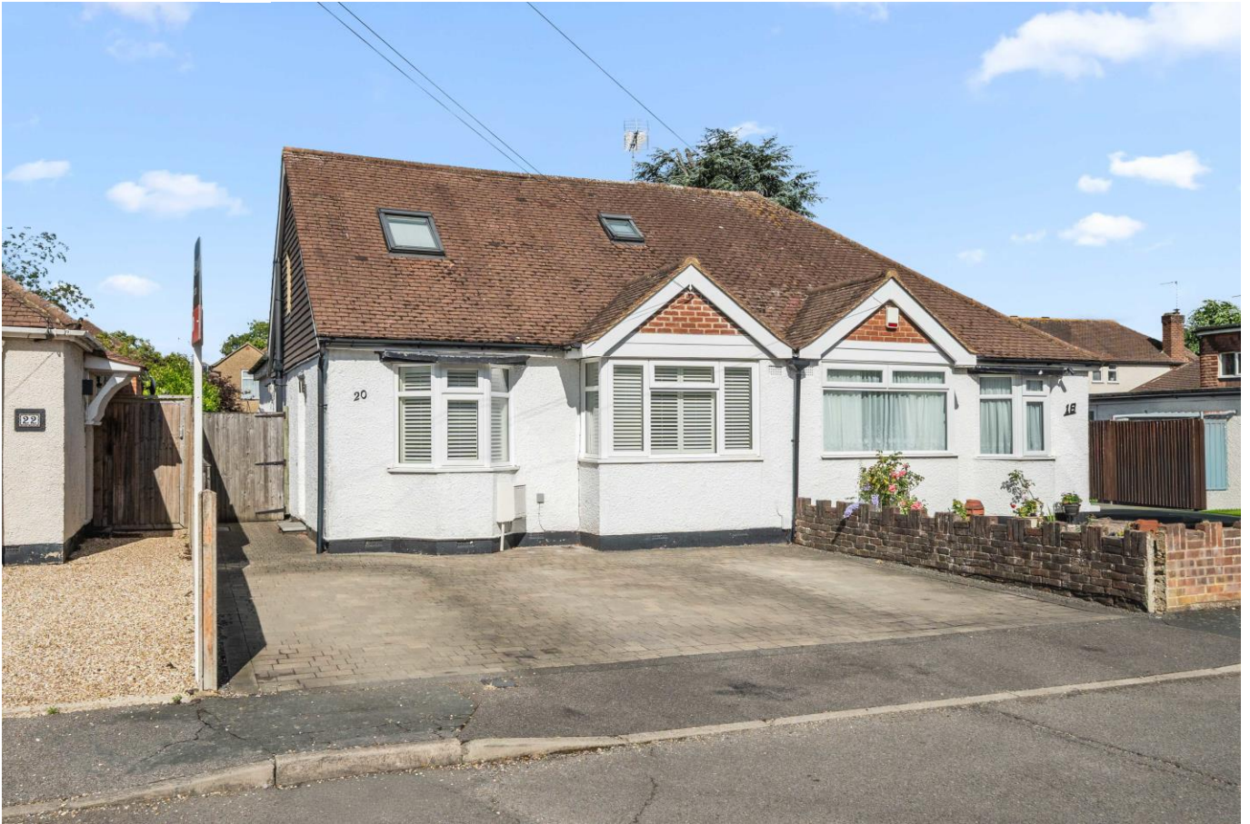
20 Linden Close New Haw Surrey KT15 3HG