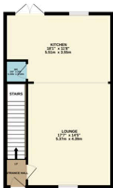
GROUND FLOOR 527 sq ft (48.7 sq m) approx.