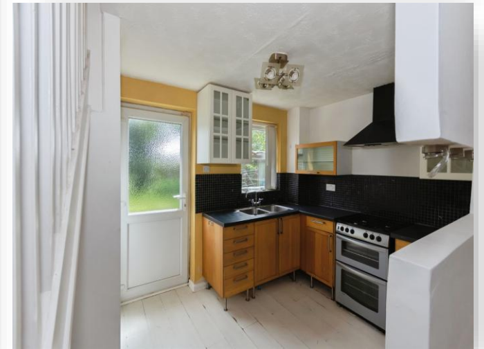
Math Meadow, BIRMINGHAM B32 2NU