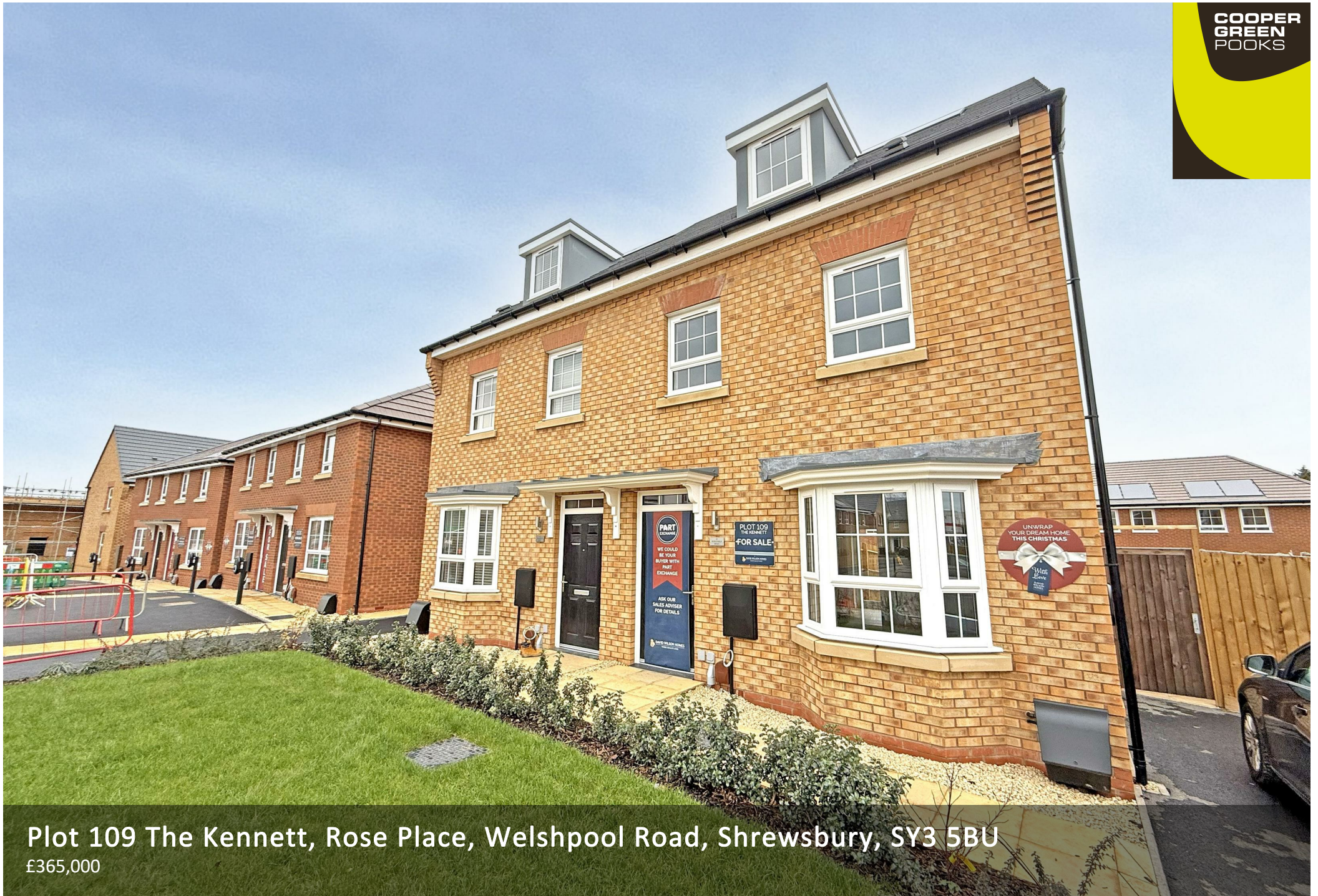
Plot 109 The Kennett, Rose Place, Welshpool Road, Shrewsbury, SY3 5BU