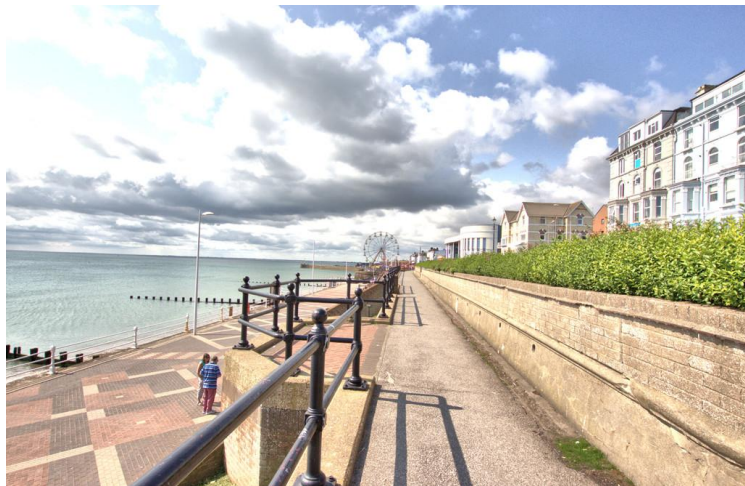
View from Promenade