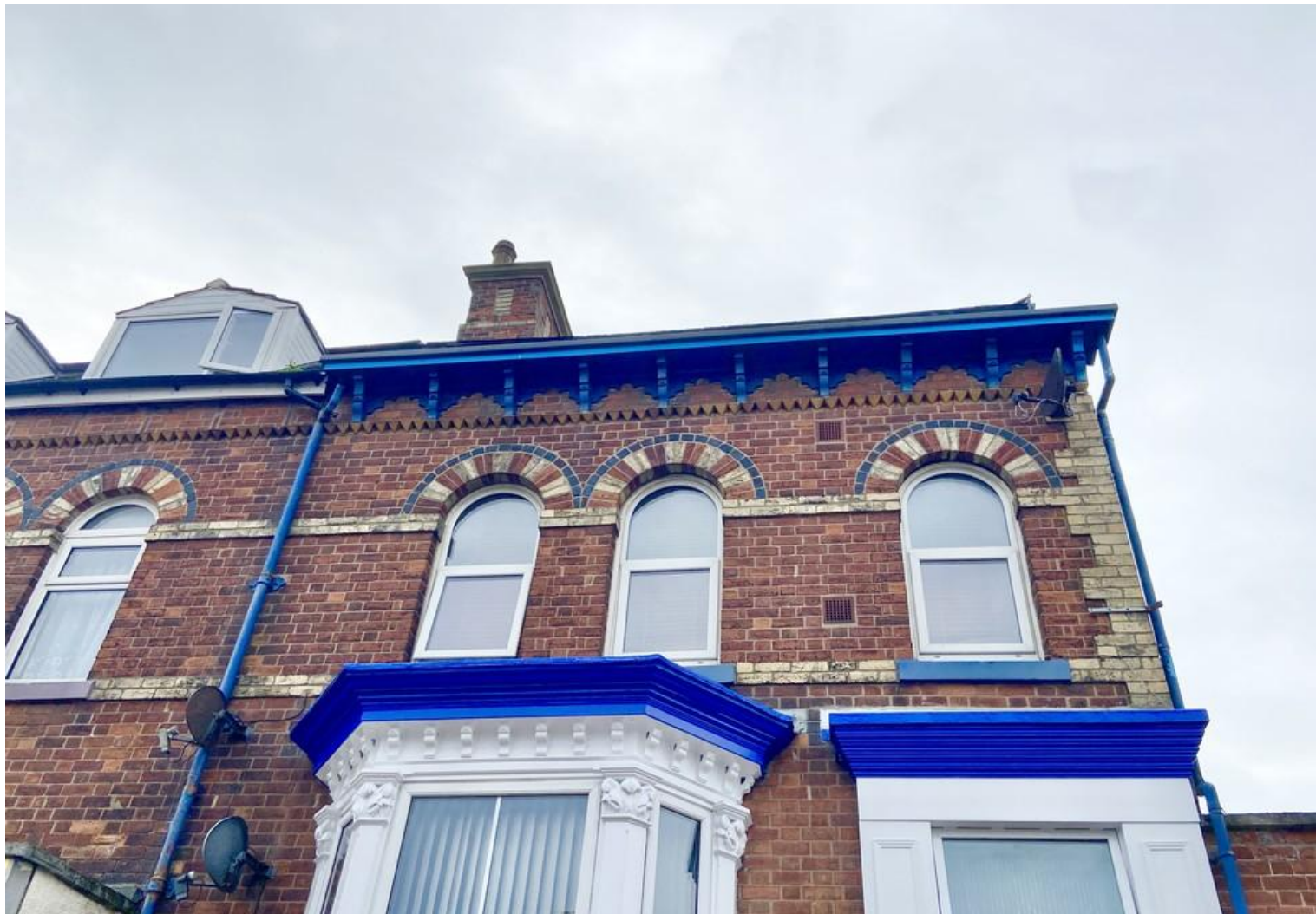
View of Flat