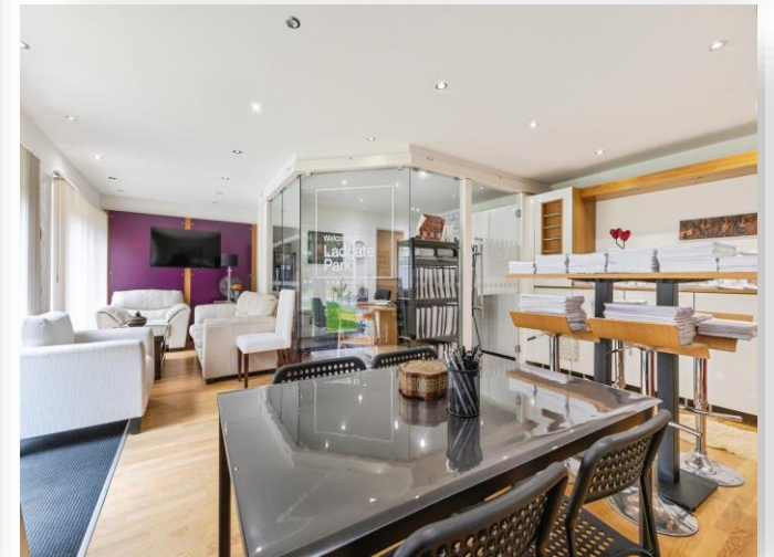
Park Wynd, Middlesbrough TS4 3FB