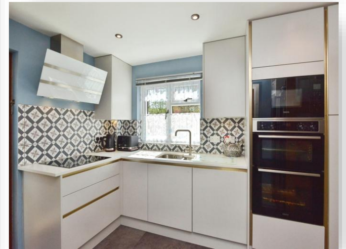
Gardiner Court, Blue Bridge Milton Keynes MK13 0LR