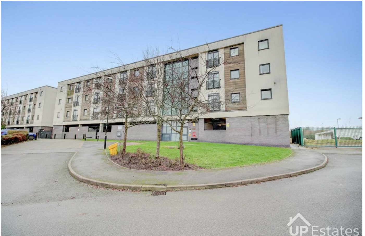
5 Paladine Way, Coventry