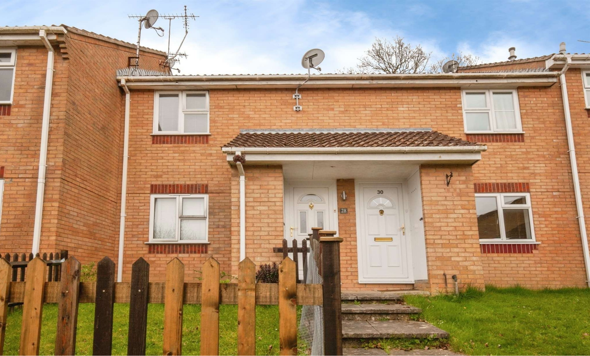
Larch Way, Haywards Heath RH16 3TY