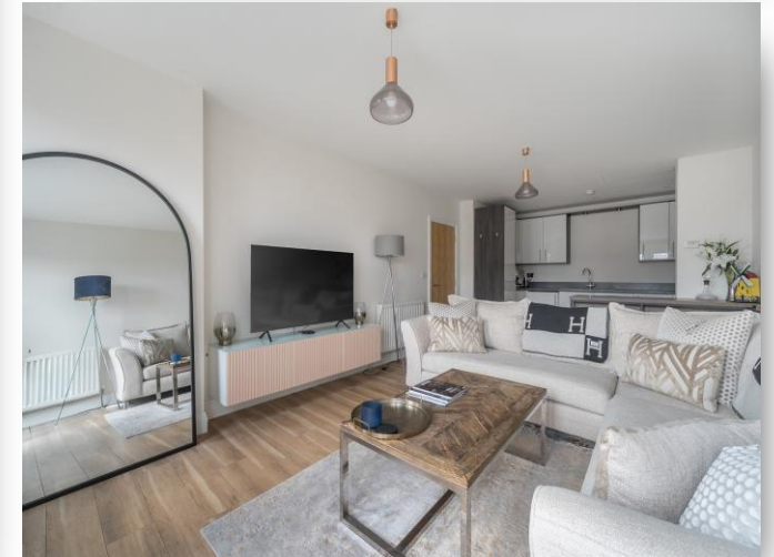
Flat 53 Kestrel Court, 4 Heron Way, Maidenhead SL6 8DJ