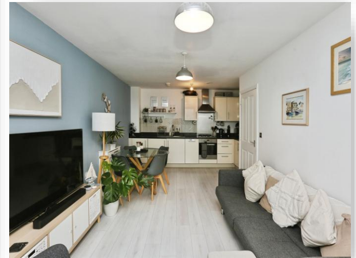
Ark Royal House Blanchard Avenue, Gosport PO13 8NR