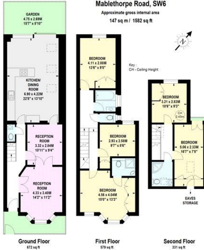
Illustration For Identification Purposes Only. Not To Scale *Floorplan Drawn According To RICS Guidelines Copyright of FeaturePRO

Approximate gross internal area 147 sq m / 1582 sq ft