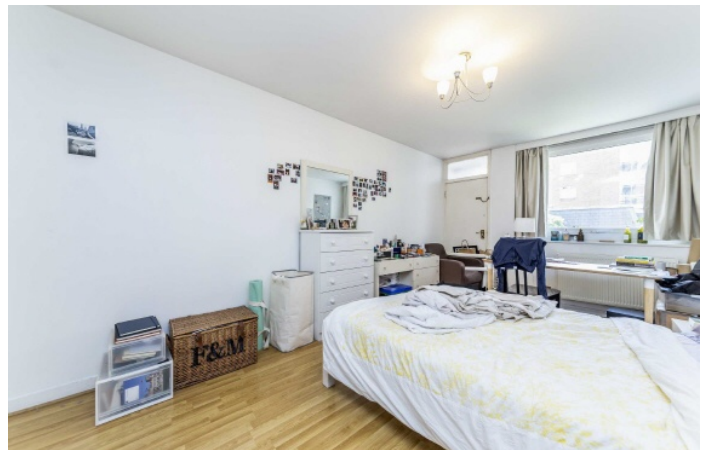
St. Petersburgh Place, W2