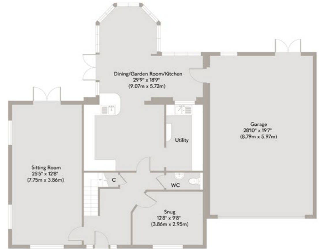
Ground Floor Approximate Floor Area 1128 sq. ft (104.79 sq. m)