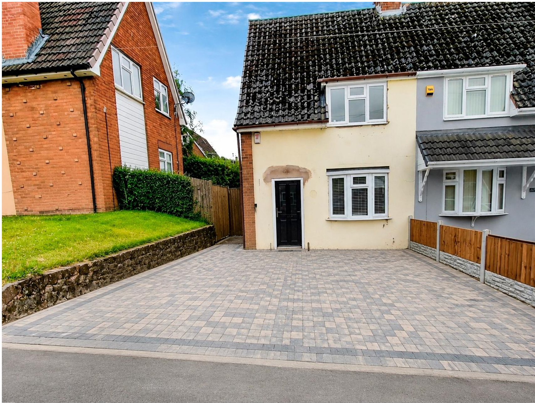
Corbyn Road, Dudley DY1 2JY