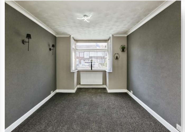
Tewkesbury Avenue, Gosport, PO12 4JA