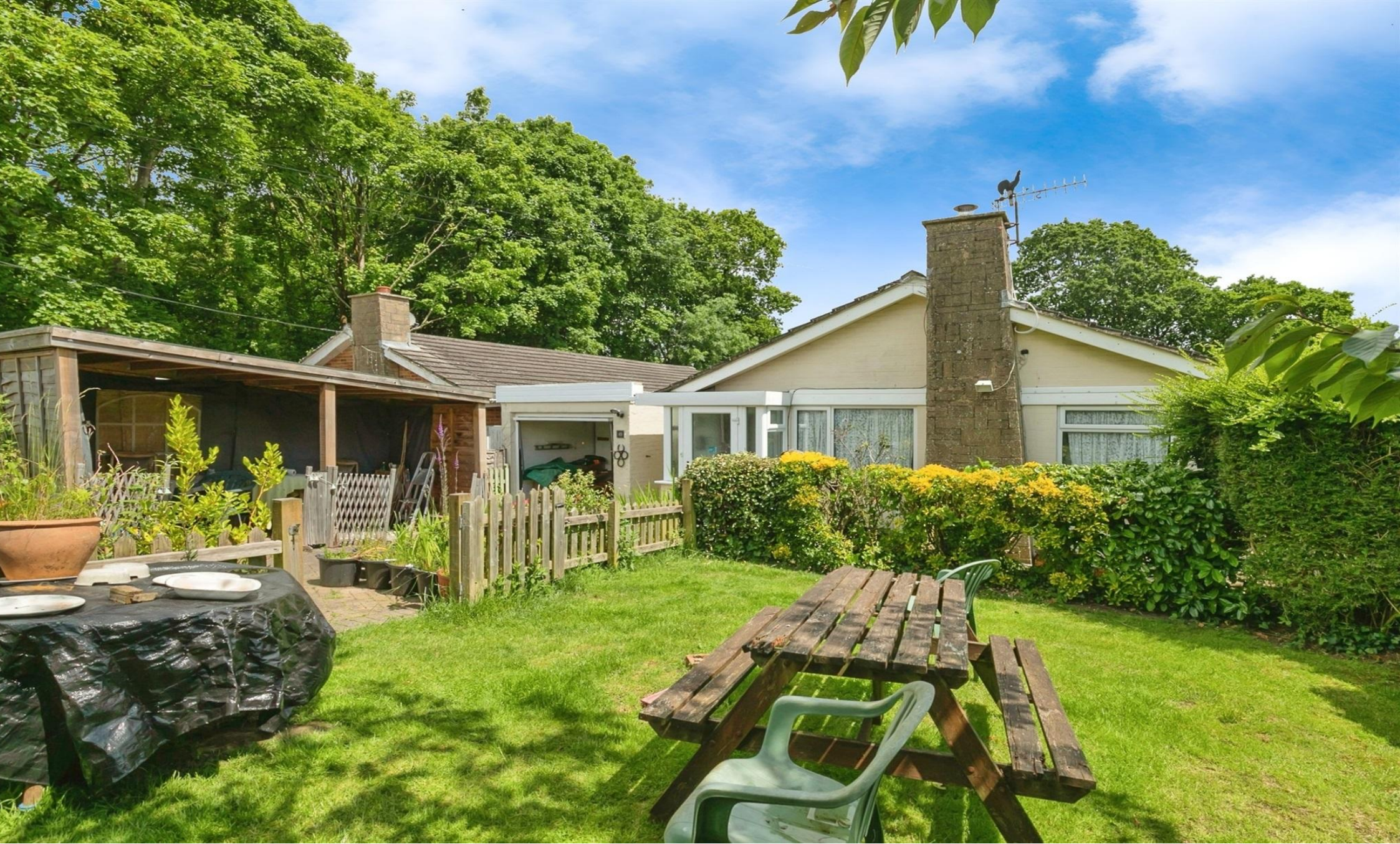
Oaklea Close, St. Leonards-On-Sea TN37 7HB