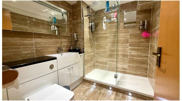
Large shower stall with electric shower, vanity wash hand basin and w.c. and granite top, mirror with sensor light, wall mounted electric fan heater, floor tiling, extractor fan, coving, downlighters.