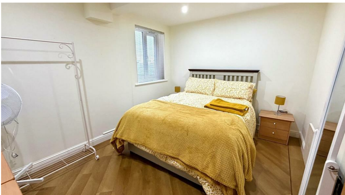
'Karndean' flooring, coving, downlighters, electric heater.