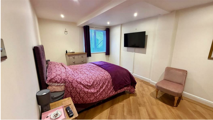
'Karndean' flooring, coving, downlighters, upvc double glazed window, electric heater.