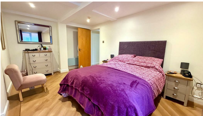
BEDROOM 2 11'8" x 8'10" (3.58m x 2.71m)