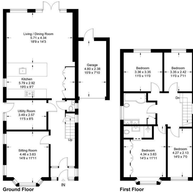
Illustration for identification purposes only, measurements are approximate, not to scale. Fourlabs.co © (ID1287404)

Approximate Gross Internal Area = 147.9 sq m / 1592 sq ft Garage = 11.6 sq m / 125 sq ft Total = 159.5 sq m / 1717 sq ft