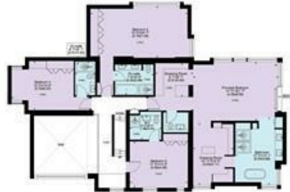
First Floor - Approx 2035 Sq ft - 189 Sq m

For identification only, Not to Scale Produced for and copyrighted, to TK international ©