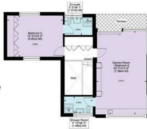
Second Floor - Approx 751 Sq ft - 70 Sq m

For identification only, Not to Scale Produced for and copyrighted, to TK international ©