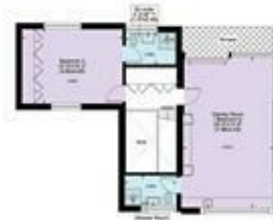
Second Floor - Approx 751 Sq ft - 70 Sq m