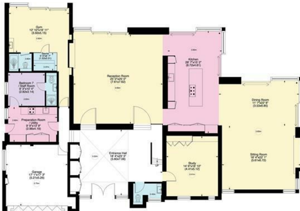
Ground Floor - Approx 3575 Sq ft - 332 Sq m

Not to Scale, for guidance only and must not be relied upon as a statement of fact. All measurements areas are approximate only (and have been prepared in accordance with the current edition of the RICS Code of Measuring Practice).