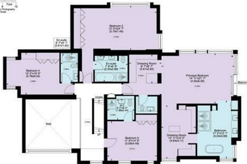
First Floor - Approx 2035 Sq ft - 189 Sq m