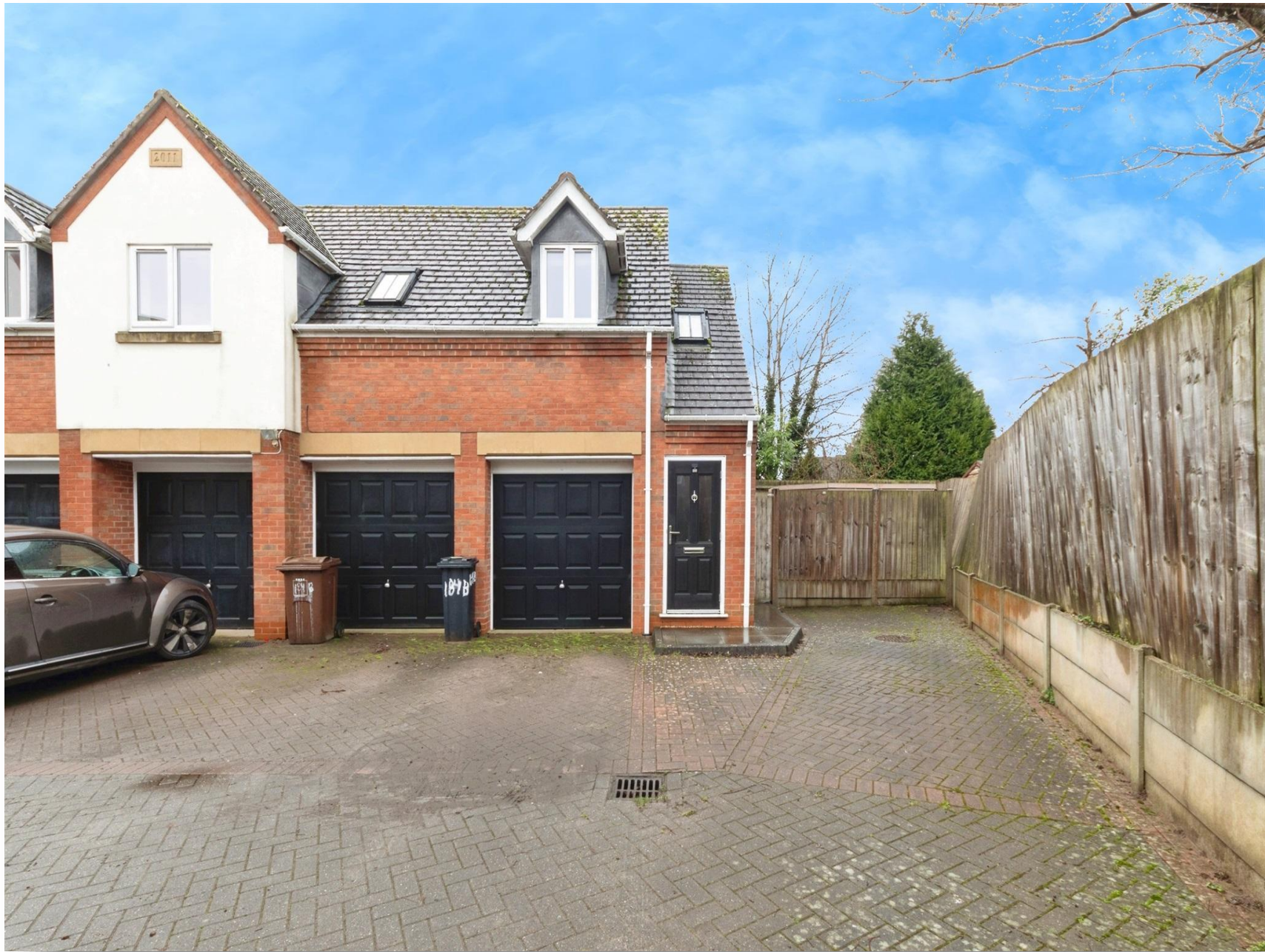
Marshall Lake Road, Shirley Solihull B90 4RH