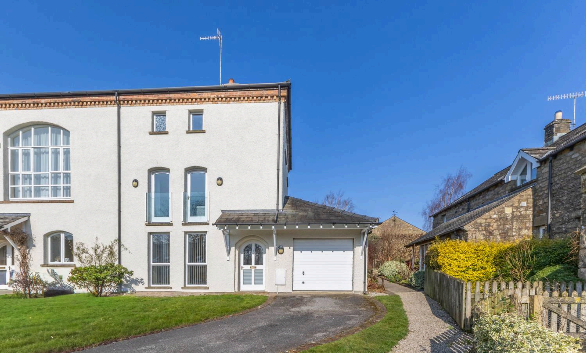
1 Clifford Hall, Burton In Lonsdale £335,000