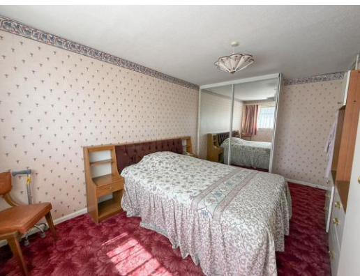
Kirby Close, Ipswich, IP4 4PU