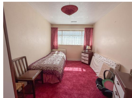
Price £280,000 Freehold

ipswich & suffolk estate agents Part of the Your Ipswich Group