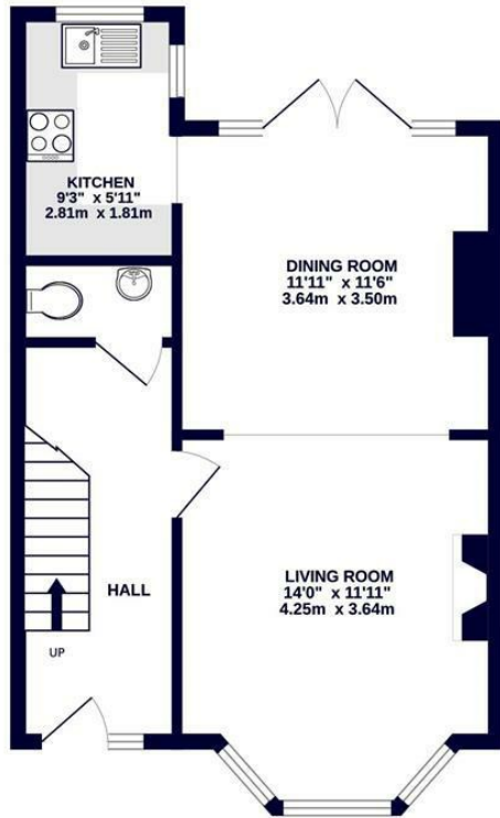
GROUND FLOOR 442 sq.ft. (41.1 sq.m.) approx.