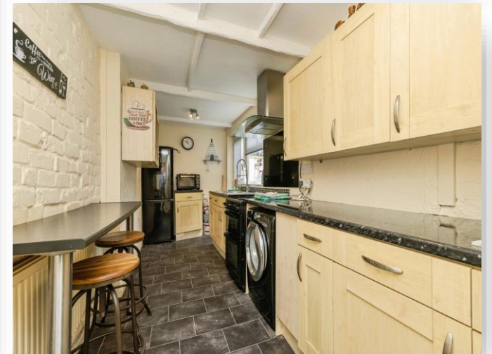
Everett Street, Hartlepool, TS26 0JB