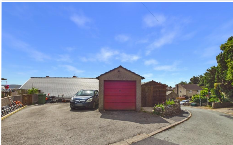
Garage and Parking Space