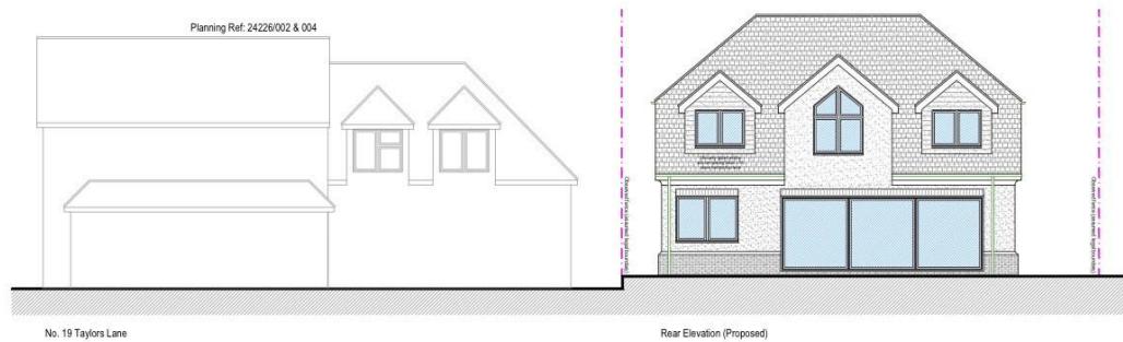
No. 19 Taylors Lane