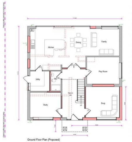
Ground Floor Plan (Proposed)