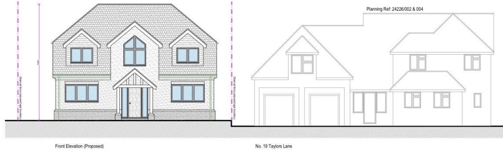
Front Elevation (Proposed)