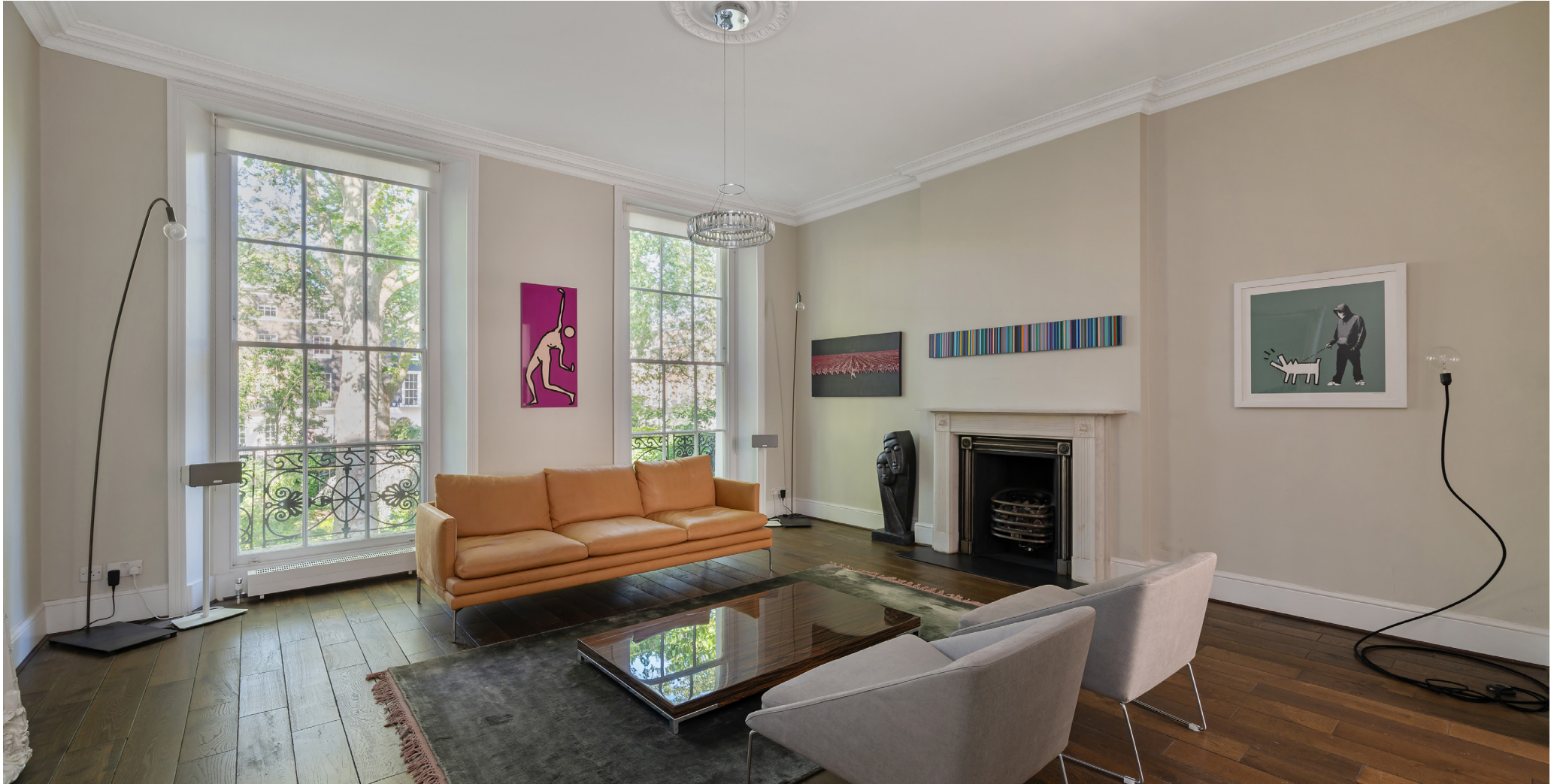
CONNAUGHT SQAURE, Hyde Park W2