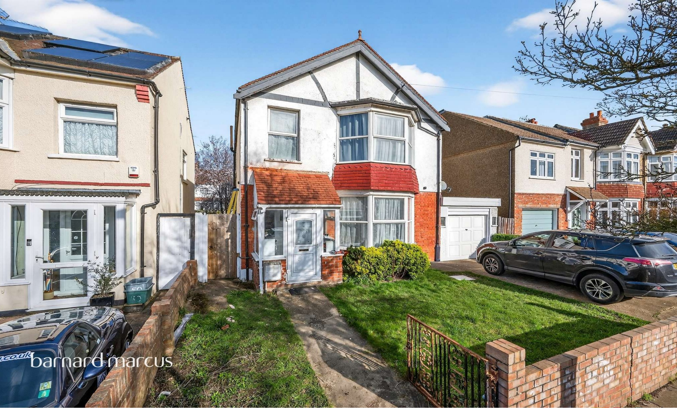
Coombe Gardens, New Malden, KT3 4AA