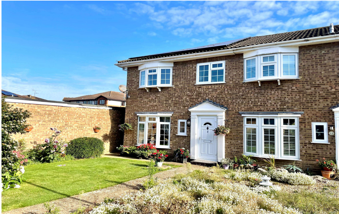
Albany Place, Egham, Surrey, TW20 9HG