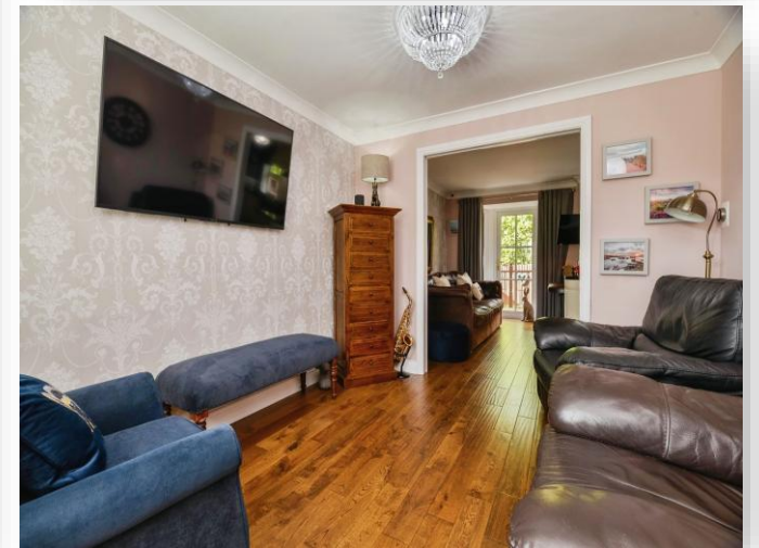
Buttercup Close, Stockton-On-Tees TS19 8FE